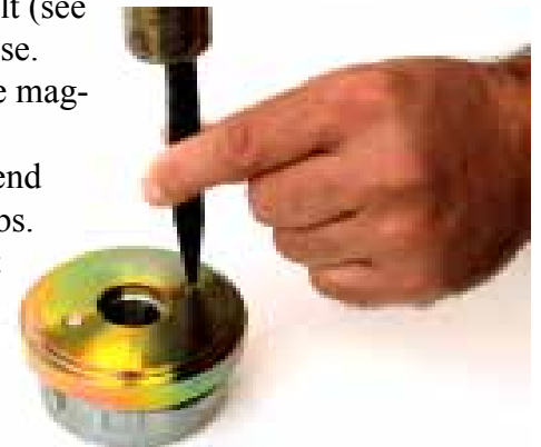
Bolt end after center punching, notice the flared edge.